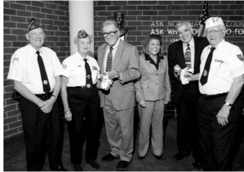
VFW - Poppy Days Proclamation