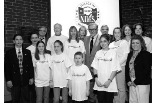
Community Track and Field Day Proclamation